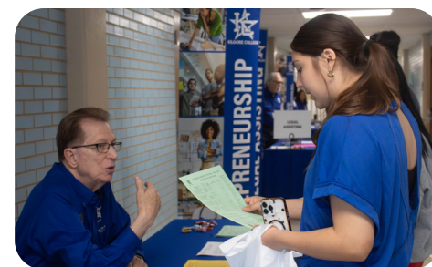
PHOTOS ABOVE: KC had a record number of students in attendance at Preview Day.