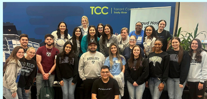
PHOTO ABOVE: With emerging leaders like these, the future of radiologic science continues to shine brightly.

The event offered students the opportunity to network with professionals from across Texas and gain valuable insights into the future of the radiologic science field. Their professionalism, dedication, and enthusiasm stood out throughout the symposium.