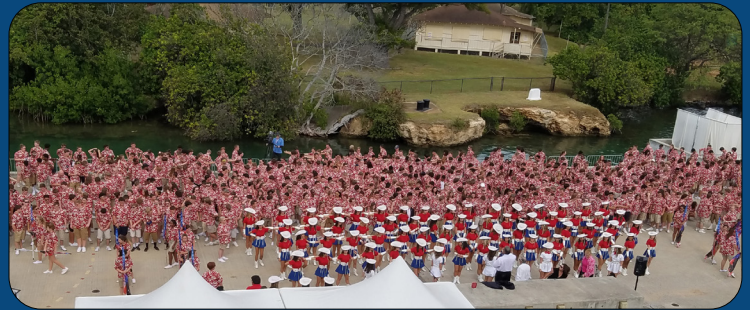
ABOVE: The Rangerettes participate in Pearl Harbor Memorial services in Hawaii in 2016. This year is the third time in 10 years that the Rangerettes have traveled to Hawaii for the ceremony.

The Pearl Harbor Remembrance Ceremony is set for 11:30 a.m. (CST) Dec. 7 at the Pearl Harbor National Memorial. Later that day, the Rangerettes will perform in the Pearl Harbor Memorial Parade at 10 p.m. (CST) in Waikiki. You can watch the parade live here .