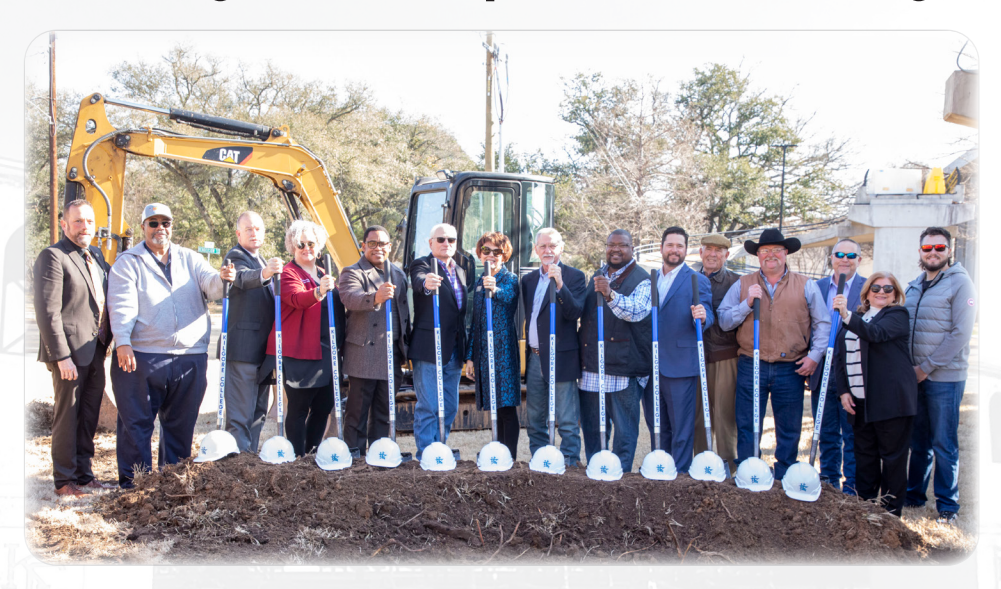
ABOVE: KC stakeholders use shovels to break ground for the new bridge.

The demolition/construction of the new pedestrian bridge is expected to take nine months. A 24-hour livestream of the bridge demolition and construction can be viewed during the duration of the project by visiting www.kilgore.edu/kc-bridge-cam.