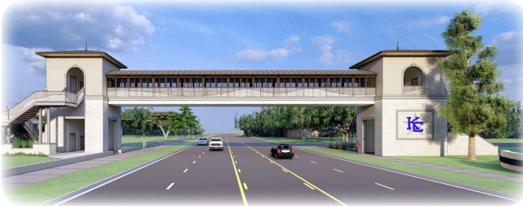
ABOVE: Artist rendering of the new KC bridge over Highway 259.

KC will hold an official groundbreaking in January to celebrate the demolition of the remainder of the old pedestrian bridge and the construction of the new bridge. The groundbreaking is set for 10 a.m. Thursday, Jan. 12, at the site of the old bridge. The bridge will be ADA compliant with elevators on both sides and will truly be a landmark for the college and the community. In September, the KC Board of Trustees awarded RLM General Contractors as the contractor to demolish what is left of the pedestrian bridge, and to build a new bridge. Costs associated with the pedestrian bridge project will be covered by insurance proceeds and college reserves. The demolition/construction of the new pedestrian bridge is expected to take nine months.