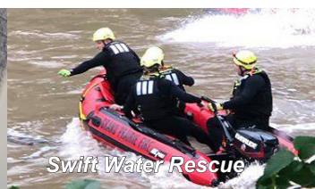
Swift Water Rescue