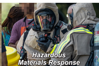
Hazardous Materials Response