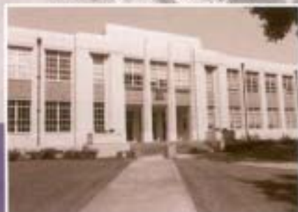
The entrance to OLD MAIN