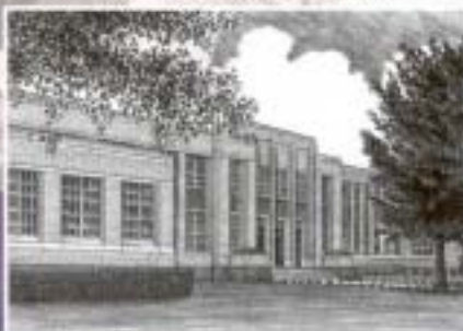
An artist's rendition of OLD MAIN from 1943 KC Yearbook