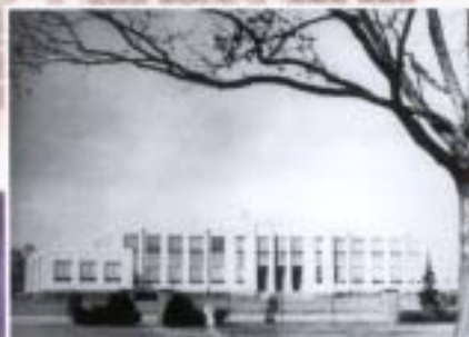
When OLD MAIN was new