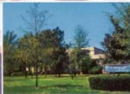
OLD MAIN in the spring