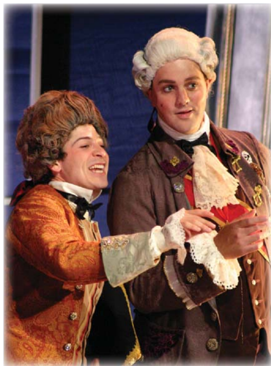
(Above) Actors perform in Peter Shaffer's Amadeus during last year's Texas Shakespeare Festival. This year, TSF will perform another Shaffer play, The Royal Hunt of the Sun .

T ickets are on sale for the Texas Shakespeare Festival's summer season. The festival will run July 3 - Aug. 3. This year's lineup includes Shakespeare's Twelfth Night and Julius Caesar , Peter Shaffer's The Royal Hunt of the Sun , the American musical classic 1776 and The Magic Lotus Lantern , an original children's show based on a popular Chinese folktale.