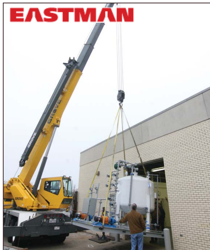
(Above) A crane hoists the new industrial-sized "flow loop" into the M. Kenneth Whitten Applied Technology Center. The device will give students hands-on training for a career in process technology.