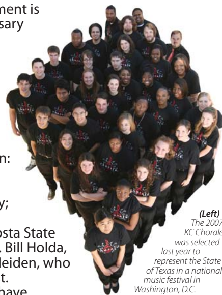
(Left) The 2007 KC Chorale was selected last year to represent the State of Texas in a national music festival in Washington, D.C.